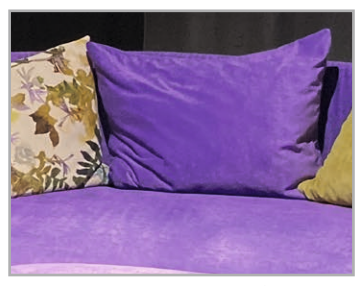
Practical cushions for individual seating comfort