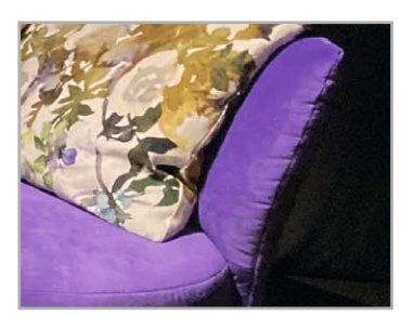
Soft back in cushion optic