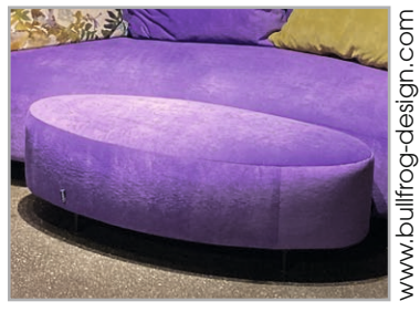
A practical stool