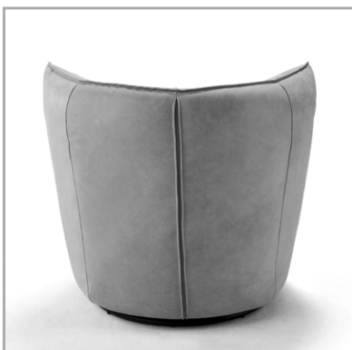
Decorative zipper, back side