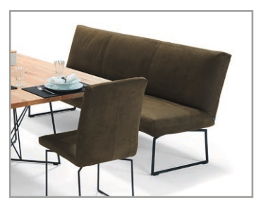
Comfortable bench, optionally with or without amrest