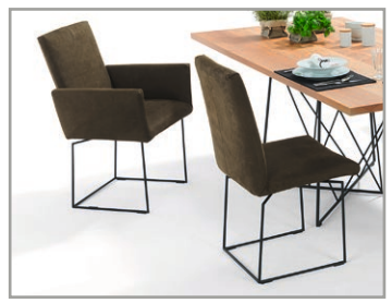
Casual chair with functional back, optionally with or without amrest