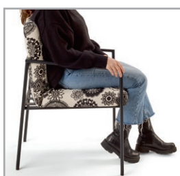
Loosely inserted seat cushion offers an individual sitting comfort