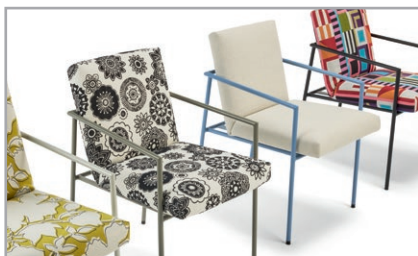
Base frame optionally available in 4 colours