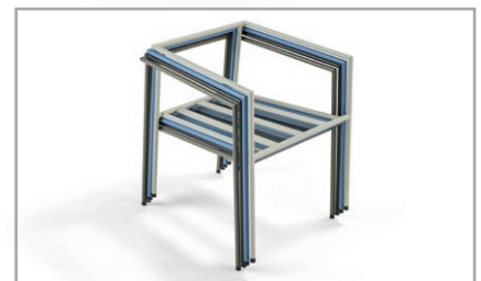
Stackable (without seat cushion)