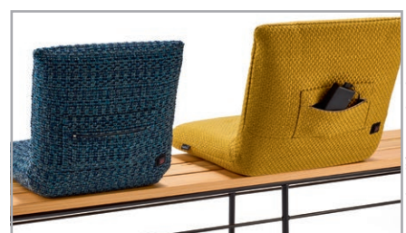
Optionally functional cushion or heatable functional cushion - hotfrog (Powerbank not included in scope of delivery)