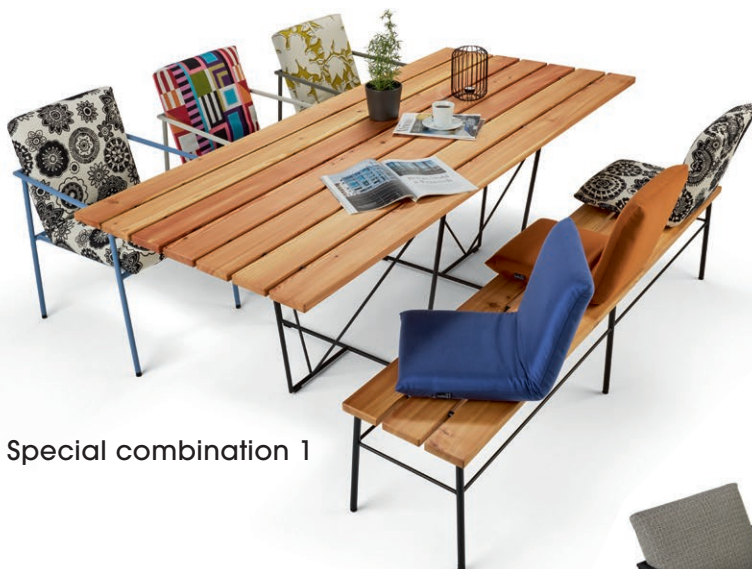
Special combination 1