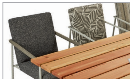
Optional metal base frame with or without wrapped armrest