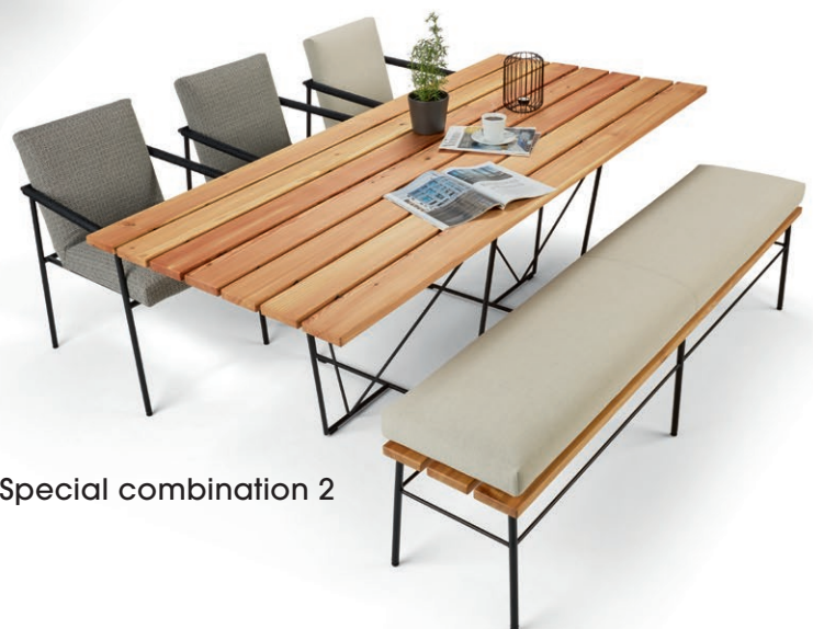
Special combination 2