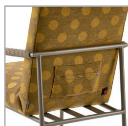
Optionally hotfrog: heatable chair cushion