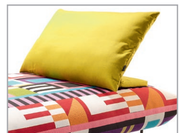
Variable positioning Moba, functional cushion in different sizes