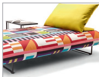
Cushion look on filigree skirts, variable placeable in the room