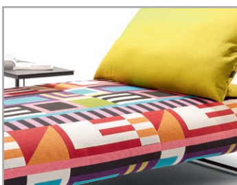
Soft sitting comfort