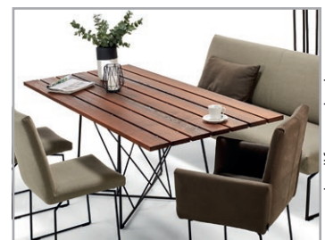
Matching, planked solid wood dining table