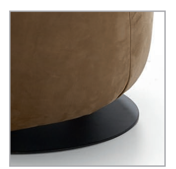
Metal turning and swing system, matt black fine structure powder-coated