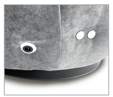
Charging port and control buttons