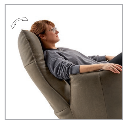
Motorised back option