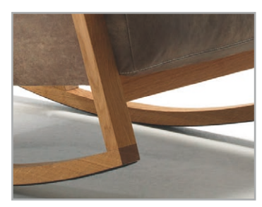
Wild steamed and oiled oak