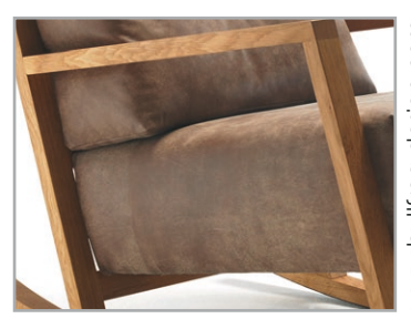
Soft seat- and back upholstery