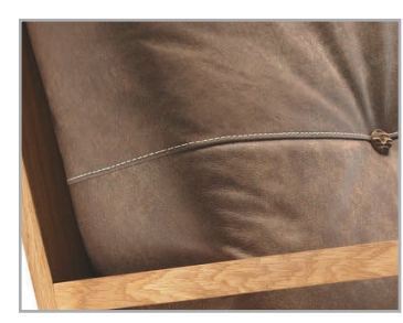
Noble decoration seam