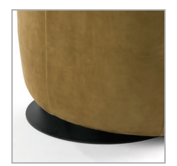
METAL TURNING AND SWING SYSTEM, MAIT BLACK FINE STRUCTURE POWDER-COATED

{}^{\star}\!\text{Zipper piping:} optionally in the colours black, red, nature or light grey.