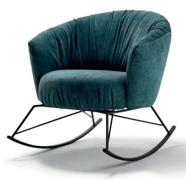
Type 109, leather