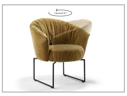
360° rotating function on filigree frame