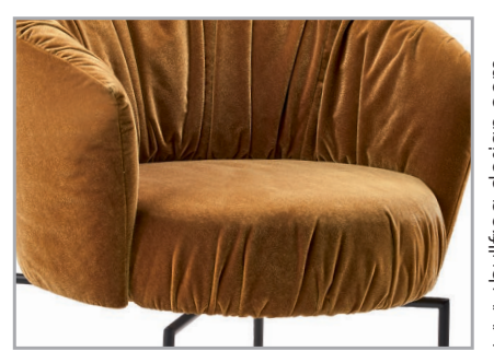
Seating comfort with pocket spring core