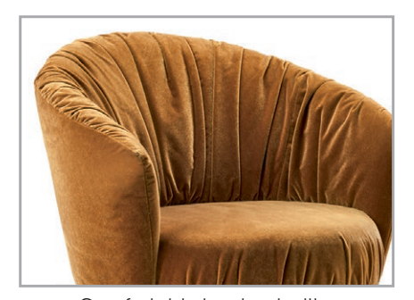
Comfortable backrest with decorative pleating